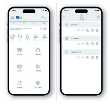
ELTAKO GFA5 app